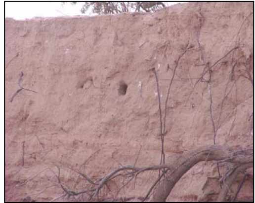
The holes are nests dug by Plain Martin (Oued Ksob)