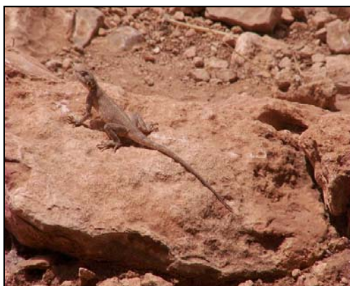
Tranelus mutabilis (Ighrem)