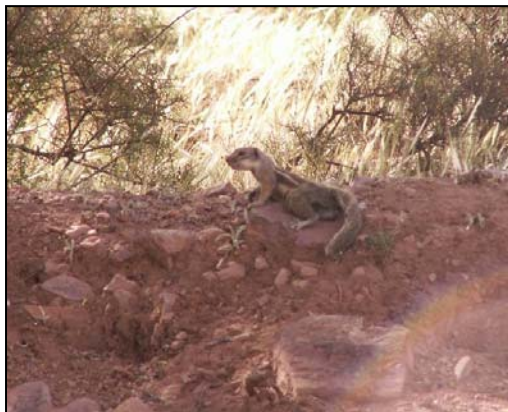
Atlantoxerus zetulus (Tafraout)

Erinaceus algerus (at least 7 hedgehogs observed crushed on the roads)