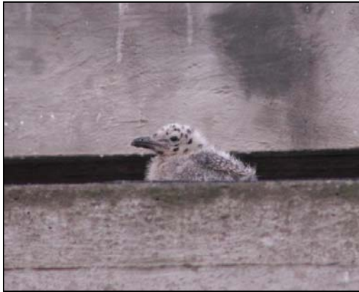
Western Yellow-legged Gull (Young)