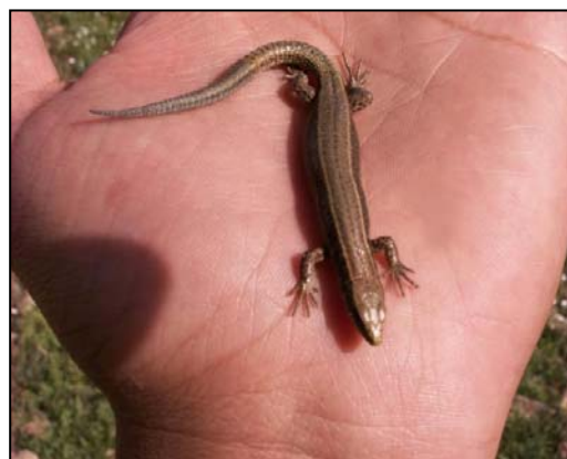
Lacerta andreanszkyi (Oukaïmden)