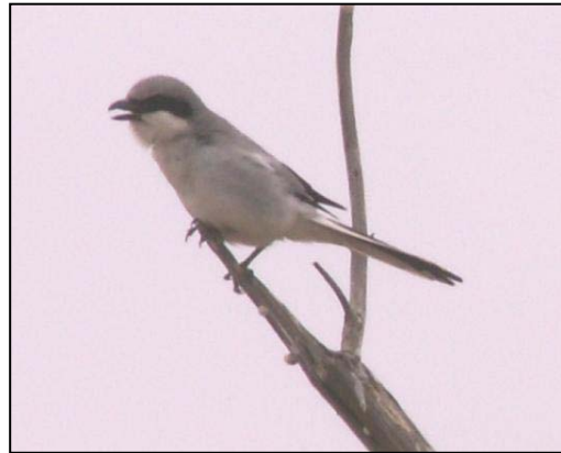
Southern Grey Shrike

Streptopelia turtur Athya noctua Upupa epops Galerida cristata Galerida thekla Pycnonotus barbarus Turdus merula Lanius meridionalis Lanius senator Sturnus unicolor (Village of Ait Baha) Pica pica mauritanicus Fringilla coelops africana Cardualis cardualis