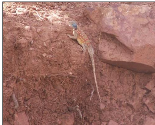
Agama bibronii (Ait Baha)