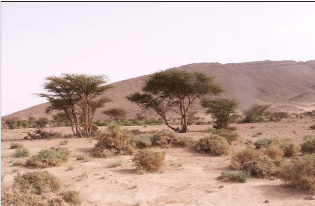
Habitat of the African Collared Dove