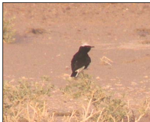
White-crowned Black Wheatear

Ciconia ciconia Hieraaetus pennata Hieraaetus fasciata Sterptopelia turtur Streptopelia decaocto Galerida cristata Galerida theckla Hirundo rustica Delichon urbicum Pycnonotus barbatus Luscinia megarhynchos